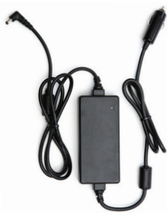
DC power supply