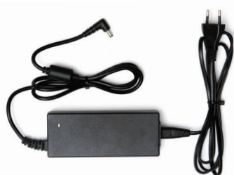
AC power supply