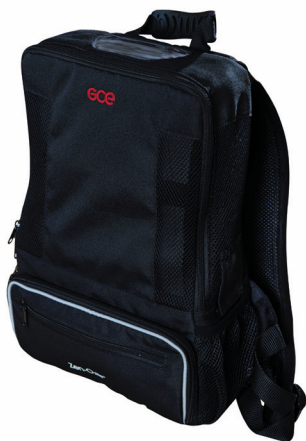
Zen-O lite™ rucksack (backpack)