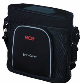
Zen-O lite™ carry bag