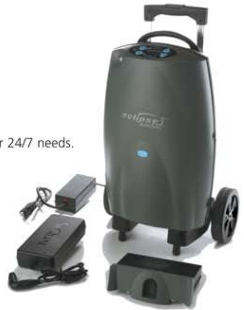
Standard Eclipse Accessories