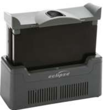
Desktop Charger PN #7112