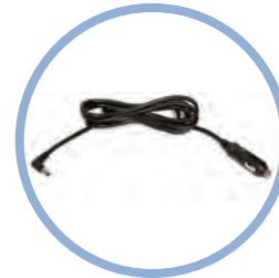
Inogen One G5 DC Power Cable* Item #BA-306