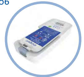
Inogen One G5 Lithium Ion Battery* Up to 6.5 hours run time Item #BA-500