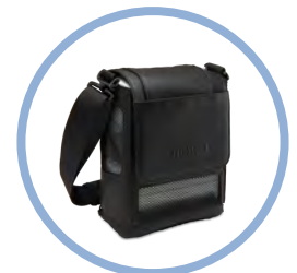
Inogen One G5 Carry Bag* Item #CA-500