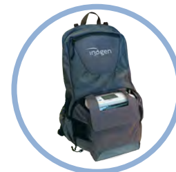
Inogen One G5 Backpack** Item #CA-550