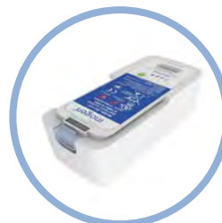
Inogen One ® G5 Extended Life Lithium Ion Battery** Up to 13 hours run time Item #BA-516