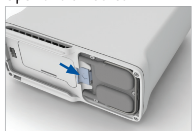
Open and unlocked

6. While holding the button open, slide the column assembly out of the device by pulling on the column pull handle.