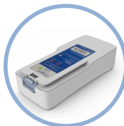
Inogen One ® G4 Extended Life Lithium Ion Battery** Up to 5 hours run time Item #BA-408