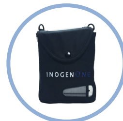
Inogen One ® G4 Carry Bag* Item # CA-400