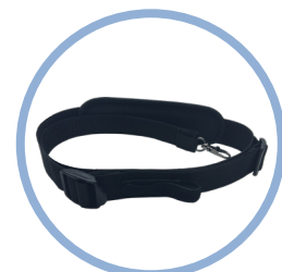
Inogen One ® G4 Carry Strap* Item # CA-401