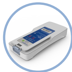
Inogen One ® G4 Lithium Ion Battery* Up to 2.7 hours run time Item #BA-400