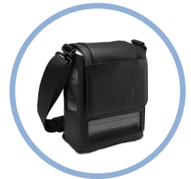
Inogen Rove 6 Carry Bag* Item #CA-500