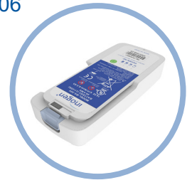
Inogen Rove 6 Standard Battery* Up to 6:15 hours run time Item #BA-500