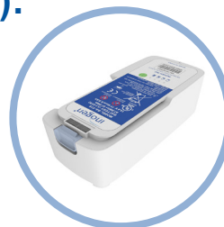
Inogen Rove 6 Extended Battery** Up to 12:45 hours run time Item #BA-516