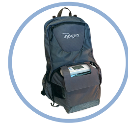
Inogen Rove 6 Backpack** Item #CA-550