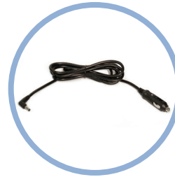
Inogen Rove 6 DC Power Cable* Item #BA-306