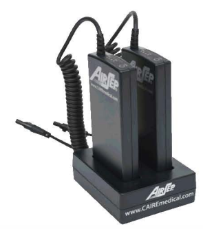
External Power Cartridge and Charger Combo (BT026-1); includes battery (1), charger (1), and power supply (1)